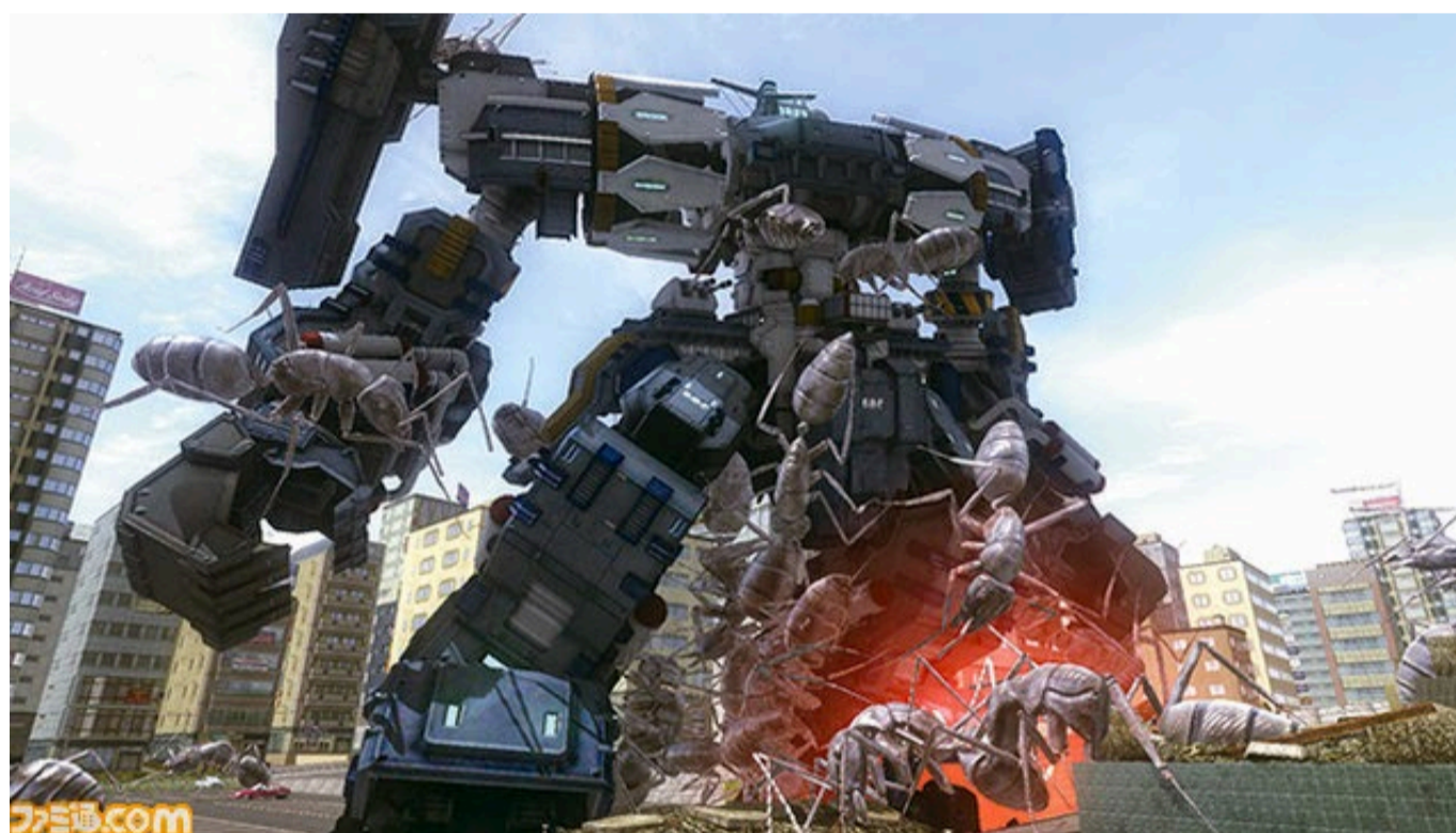
Walking Fortress Bahau Dng